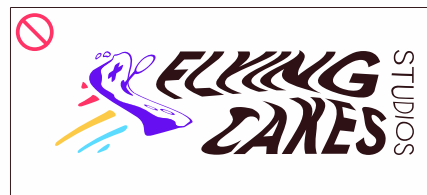
apply distortion effects