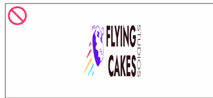
redimension without proportions

The incorrect use of the logotype risks causing a negative impact to the brand, and for that it is important to be careful not only as to how the logo should be used, but also how it should NOT be used.