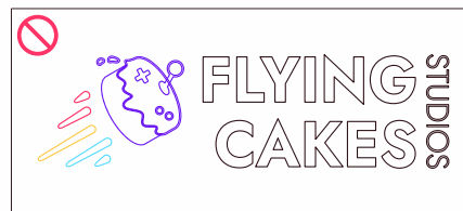
use in outlines